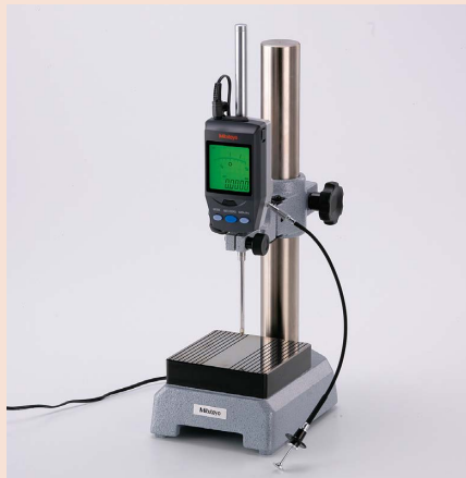
Digimatic Indicator ID-H.